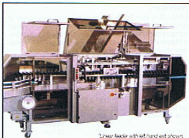
*Linear feeder with left hand exit shown.

Designed for Multiple Bottle Applications